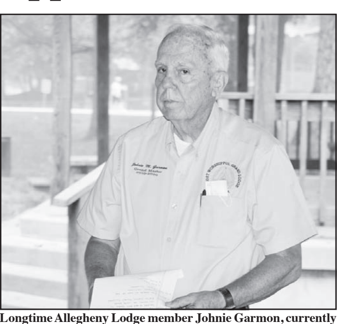
serving as the Grand Master of Masons in Georgia, called for moments of silence Friday in honor of those who died on 9/11/01.

to be there but were on the pancakes and bacon to serve